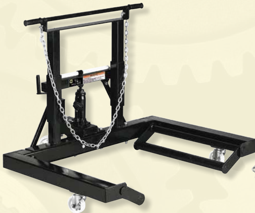
47053 1,500 Lbs. Capacity